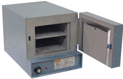
Compact In-Shop Models...