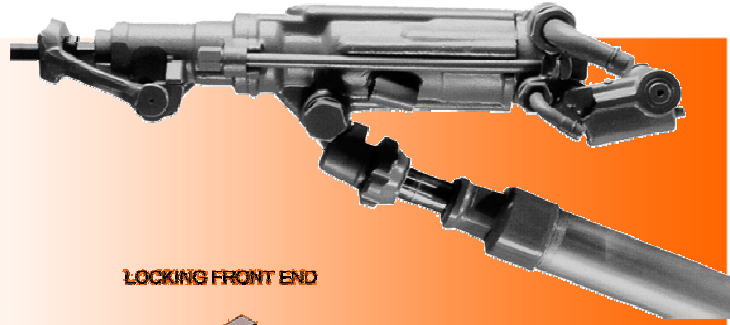
LOCKING FRONT END